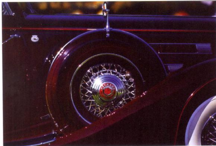
PLUM DELICIOUS, DUPONT CROMAX ON FABRICATED ALUMINUM PANELS, 48 x 70"