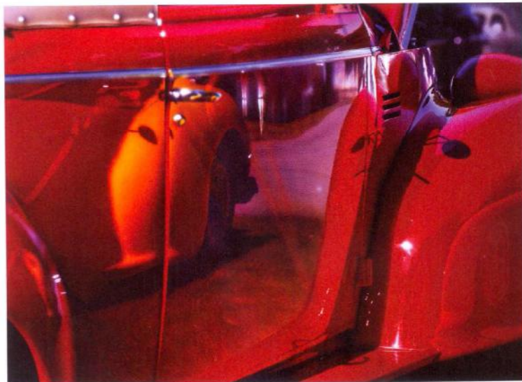
MIRAGE, DUPONT CROMAX ON FABRICATED ALUMINUM PANELS, 48 x 64"