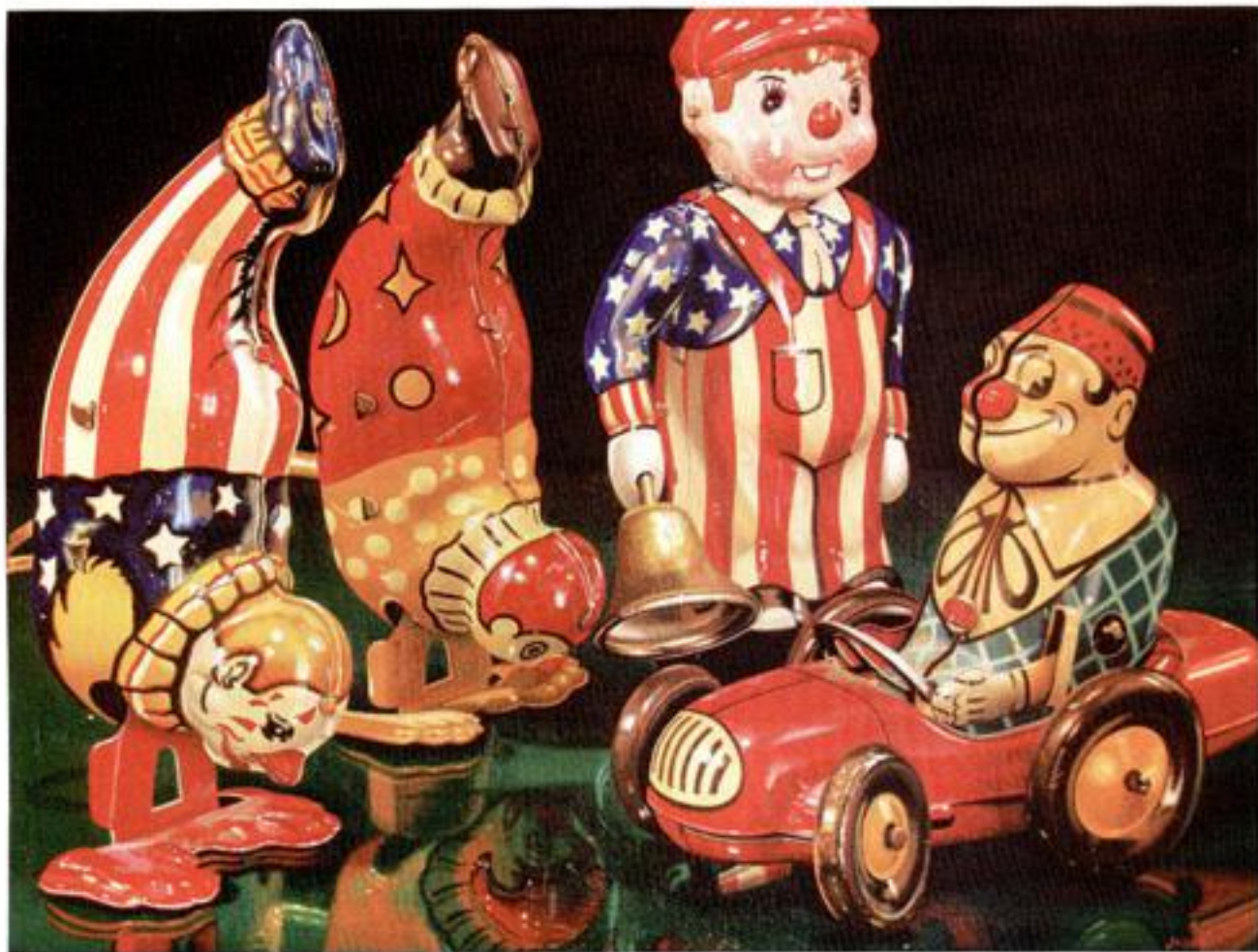
BELL AMIGO, OIL ON LINEN, 9 X 12"