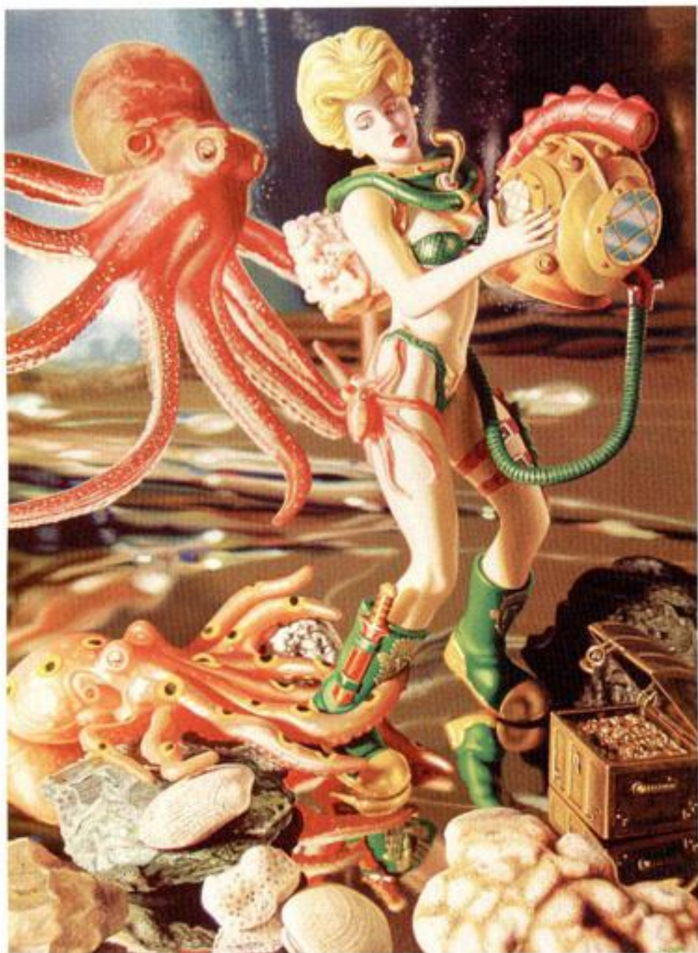
OCTOPUSES GARDEN, OIL ON LINEN, 16 X 12"