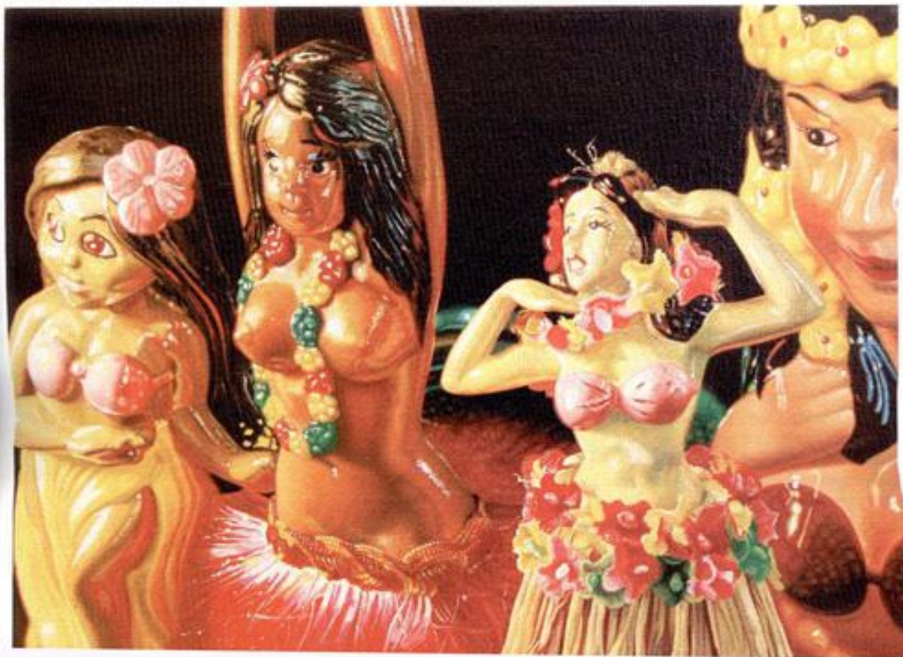
SPACE CADETS, OIL ON LINEN, 12 X 9"