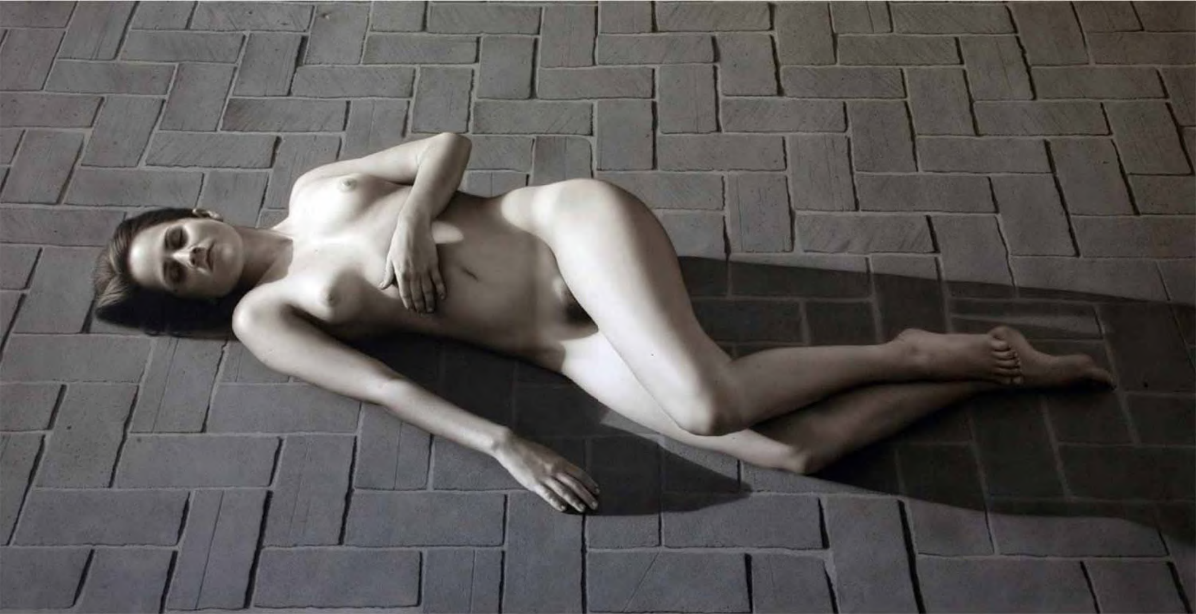
Liz III acrylic on wood 32" x 63.75"