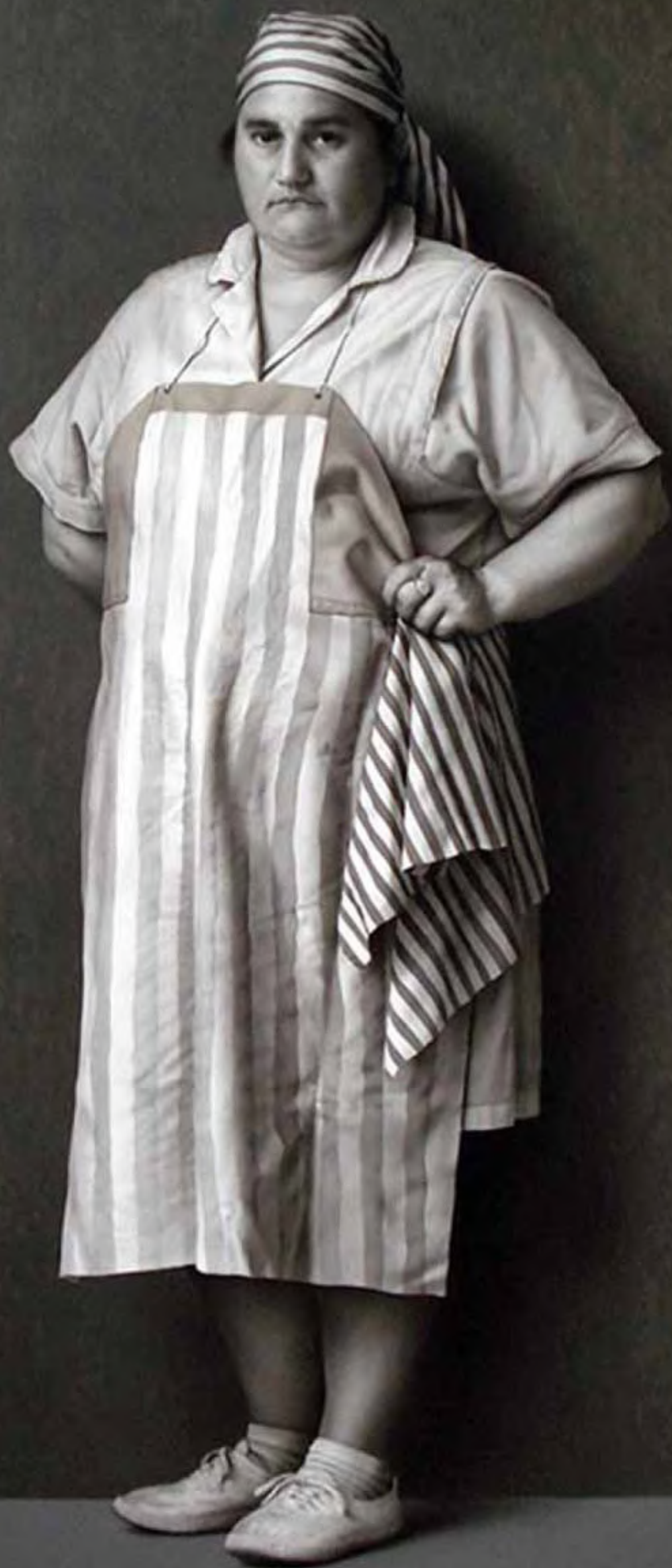
Kitchen Sculion acrylic on wood 71" x 39"