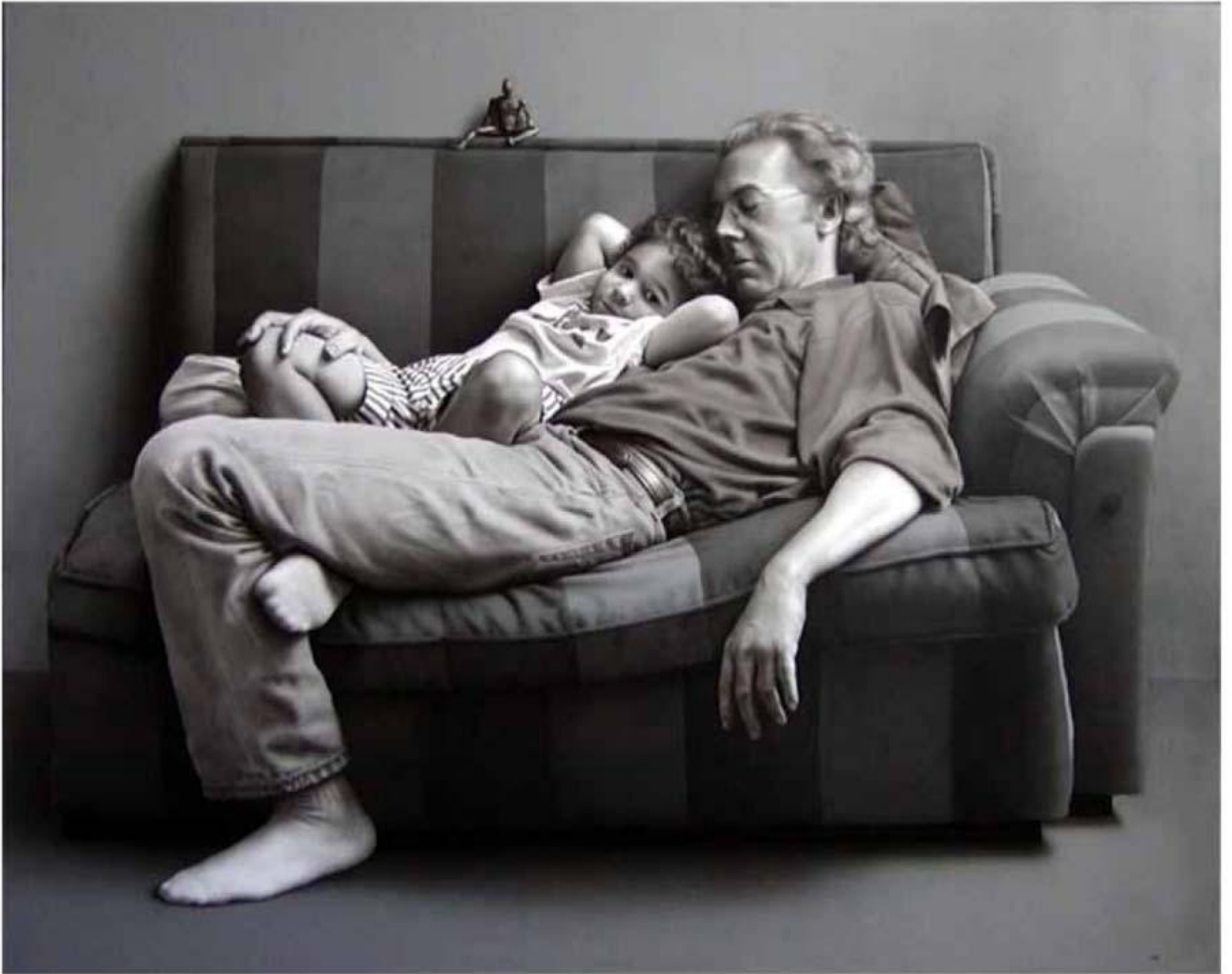
Paternity with Spiderman acrylic on wood 47" x 59"

"My work is about the human being. The deepest part of the human being. Any of my subjects tries to be the representation of humanity. Also in some cases they pretend to be the representation of a group of all people. My work also is deeply connected with my life and circumstances. Weight, intensity, sincerity, reflection are key words to describe my work. Technique, virtuosity, are only tools, not the goal. There is something else. It should be. If not... it is only 'fireworks'."