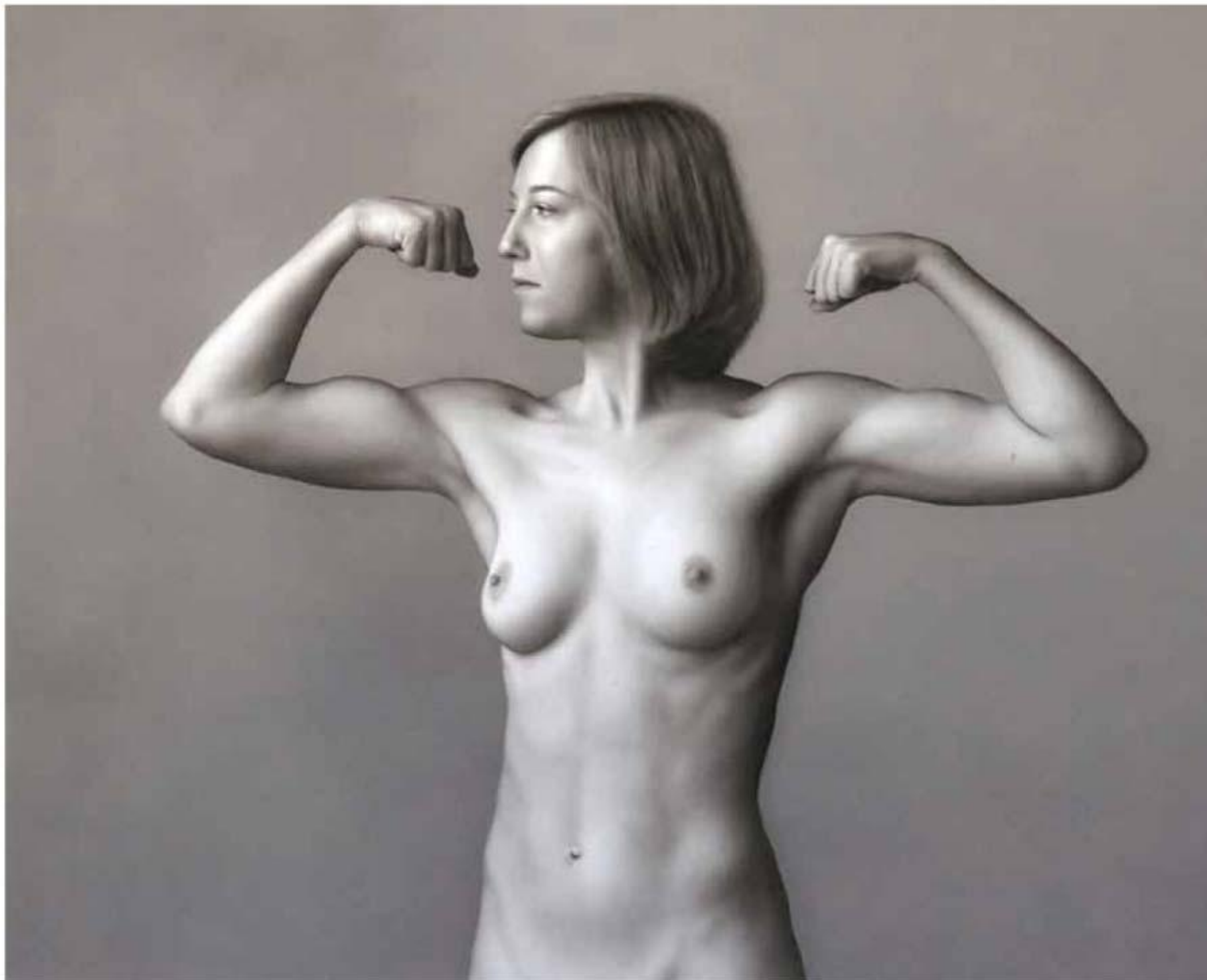
Holly I acrylic on wood 25.5" x 32"

Do you feel an urge to continue on to other techniques or have you found your signature?