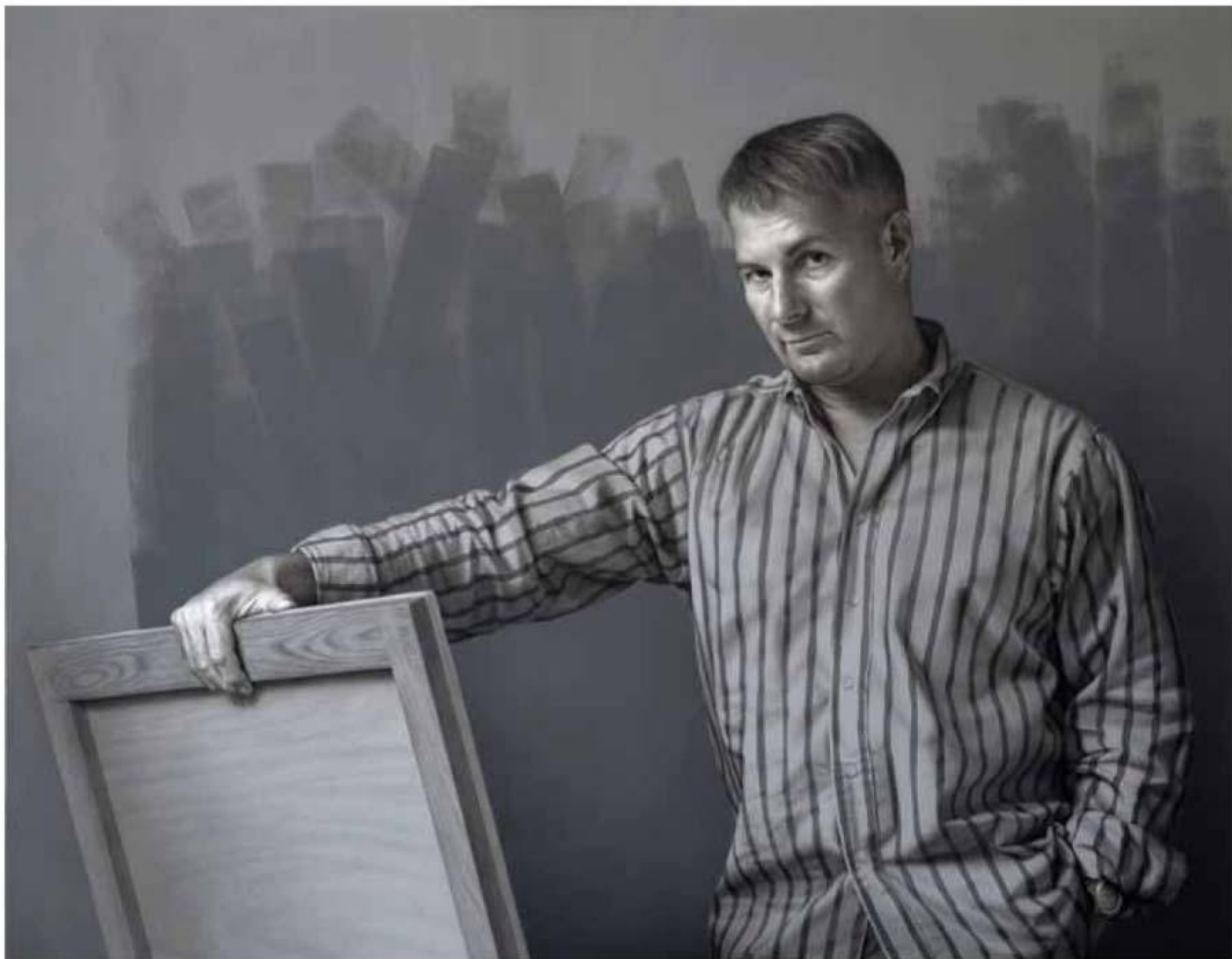
The Art Dealer acrylic on wood 38" x 45.5"