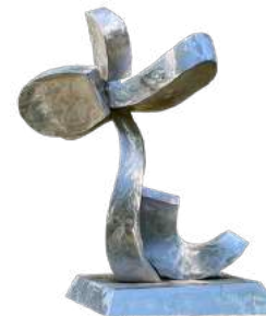
CLOUD KICKER 2005 STAINLESS STEEL 128" H X 79" W X 97" D $139,000

Description - Cloud Kicker is on a long-term loan to the Bridgehampton Child Care Center. Featuring amorphous cloud-like bubbles at its top, you can visualize the swooping motion of a child's kick that has pushed these clouds sky high. At 10 ½ feet high, this sculpture shows the artist's ability to create work with more verticality; Van de Bovenkamp has created sculptures in a vast range of sizes, ranging from sculptures that are designed for the tabletop to gargantuan works that stand forty feet tall.