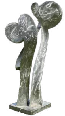
MUSE #1 2008 STAINLESS STEEL 84" H X 48" W X 24" D $54,000