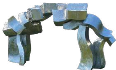
SAGG PORTAL 2008 STAINLESS STEEL 144" H X 288" W X 72" D $425,000