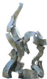
GREEN THUNDER 2011 STAINLESS STEEL 168" H X 96" W X 36" D NOT FOR SALE

Description - Inspired by lightning striking the earth, Green Thunder captures energy and movement. A classic example of Han Van de Bovenkamp's stainless steel sculpture, the work is created from amorphous fragments that are then assembled to create the artist's vision.