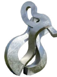
LADY GRACE 2011 STAINLESS STEEL 216" H X 96" W X 60" D $186,000

If you have further questions about the work or if you are interested in an acquisition, please email galler@meisels.com for more information!