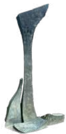
CORINTHIAN COLUMNS 2000 BRONZE 96" H X 36" W X 36" D $65,000