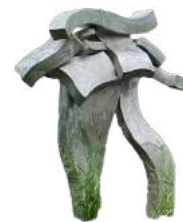
OH, OPHYLIA, WHY 2008 STAINLESS STEEL 96" H X 60" W X 36" D $139,000

Description - Named after a line from a 15th century play by Jacopo Sannazaro, this sculpture features a rather precarious balancing act. An example from the "Menhirs" series that the artist began in 2001, the "Menhirs" sculptures consist of stacked balanced shapes upon vertical blocks. Van de Bovenkamp was influenced by the piled boulders and stones from Stonehenge in England and the Baths at Virgin Gorda. While his earliest "Menhirs" were constructed with very simple forms (think Stonehenge with wavy rocks), his works evolved, as represented by this sculpture here from 2008, and featured more complex balancing acts over time.