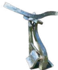
QUINTESSANCE 2003 STAINLESS STEEL 96" H X 55" W X 62" D $95,000