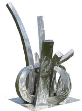
TITAN ANEMONE 2016 STAINLESS STEEL 108" H X 77" W X 70" D $95,000