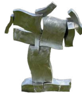
THE EMPEROR'S WISH 2012 STAINLESS STEEL 64" H X 54" W X 19" D $67,000