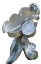
INTREPID CLOUD 2018 STAINLESS STEEL 78" H X 50" W X 54" D $70,000

Description - This freestanding sculpture possesses a bit of whimsy with its circular forms. Notice that the rounded edges of the sculpture are repeated on the stainless steel surface. This is Van de Bovenkamp's signature Hologram finish. Rather than creating a traditional mirrored stainless steel surface, these purposeful markings are etched into the steel at his studio. They create the appearance of an undulating surface that reflects light in unexpected ways. As the sun sets and the light quickly changes, the finish sparkles.