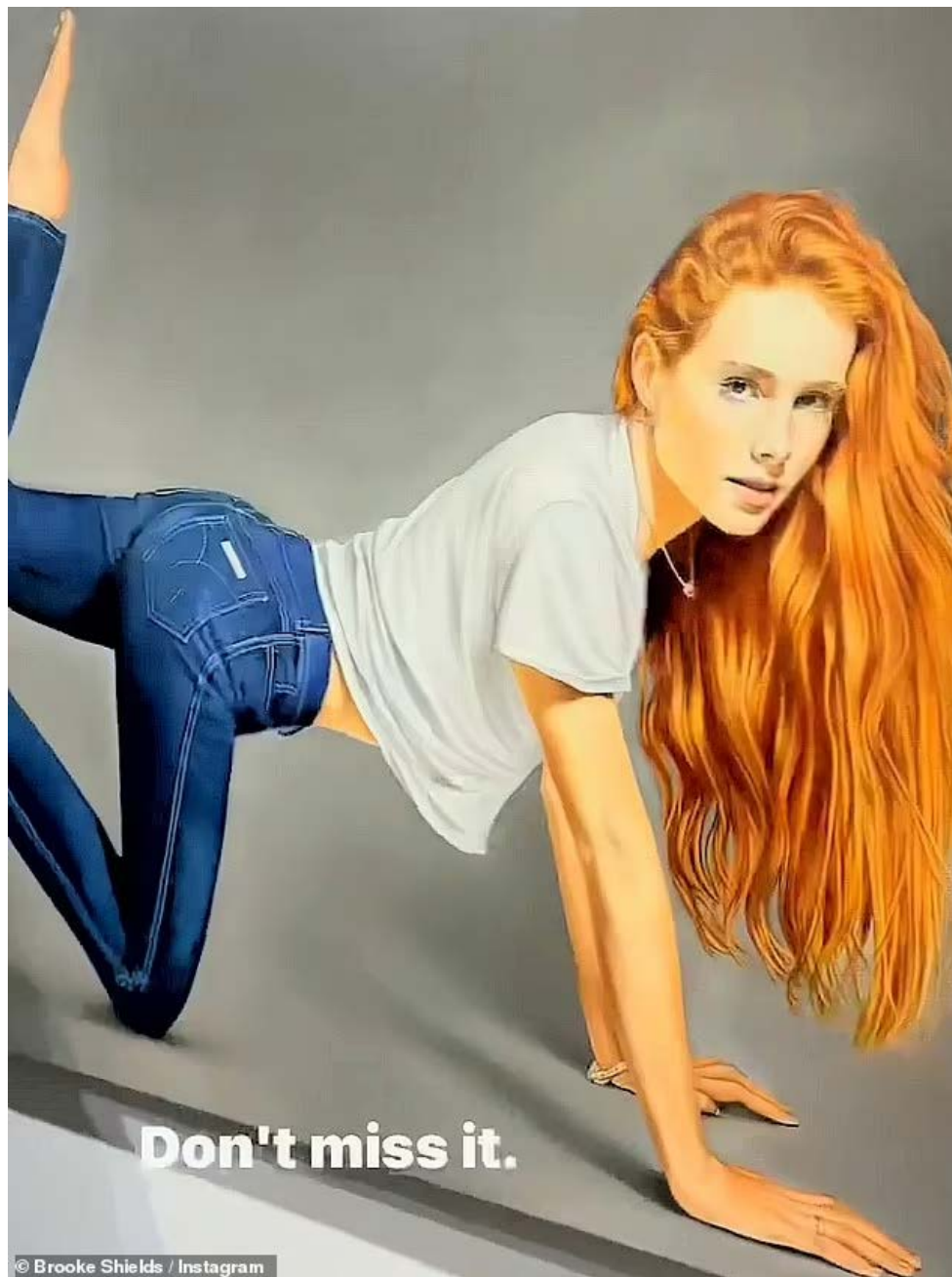
'Don't miss it': In fact, Brooke was able to fish out the Calvin Klein jeans from her original ads and give them to Grier to model for Tara