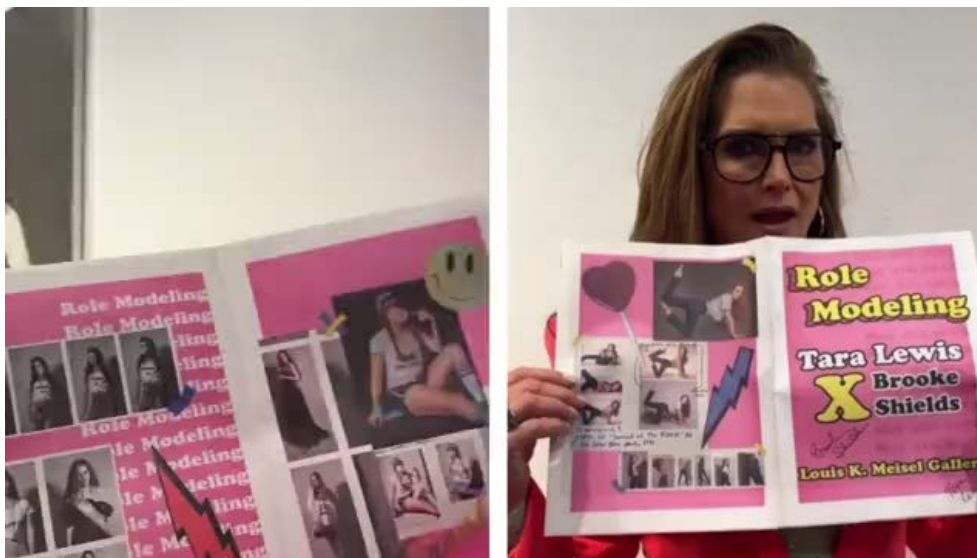
Brooke Shields promotes her 'Role Modeling' art exhibition